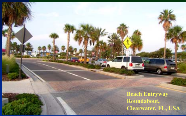
Beach Entryway Roundabout, Clearwater, FL, USA