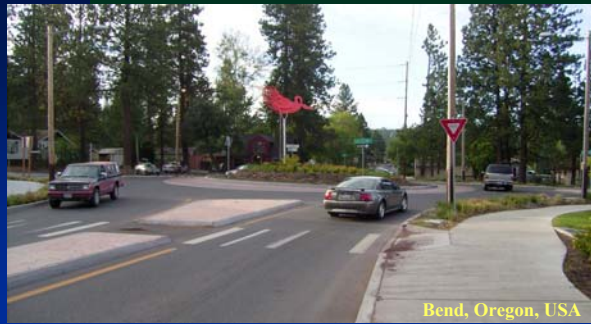
Bend, Oregon, USA