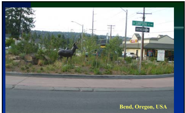
Bend, Oregon, USA