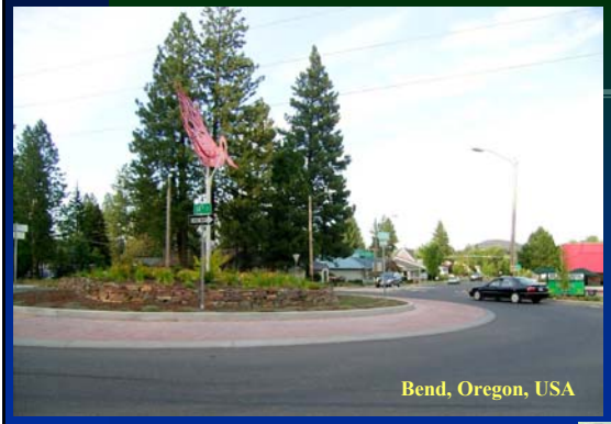
Bend, Oregon, USA