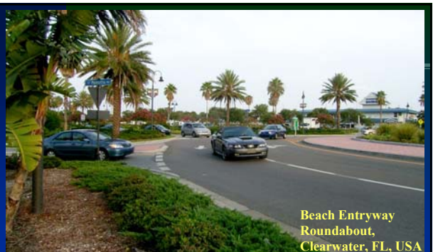
Beach Entryway Roundabout, Clearwater, FL, USA