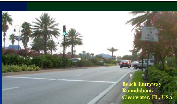
Beach Entryway Roundabout, Clearwater, FL, USA