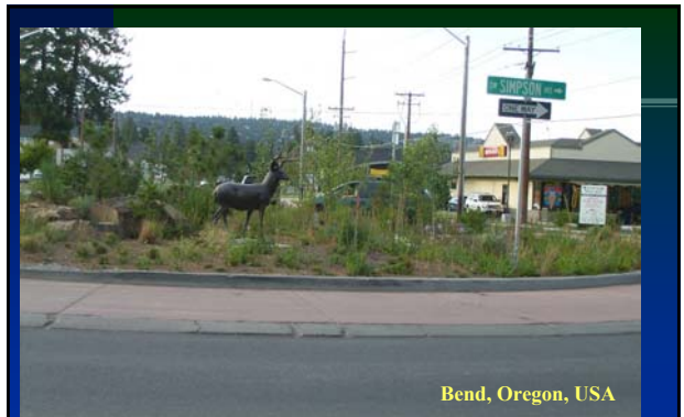
Bend, Oregon, USA