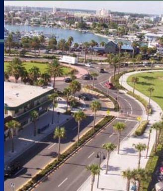
Beach Entryway Roundabout, Clearwater, FL, USA