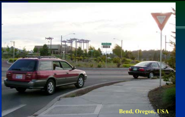
Bend, Oregon, USA