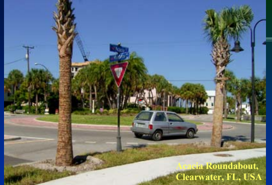
Aracia Roundabout, Clearwater, FL, USA