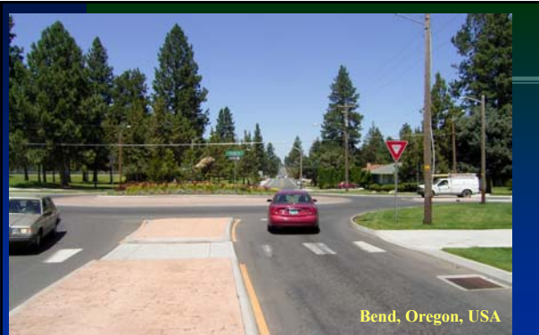
Bend, Oregon, USA