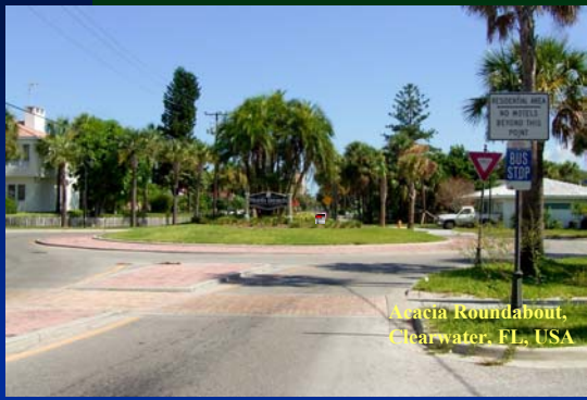
Aracia Roundabout, Clearwater, FL, USA