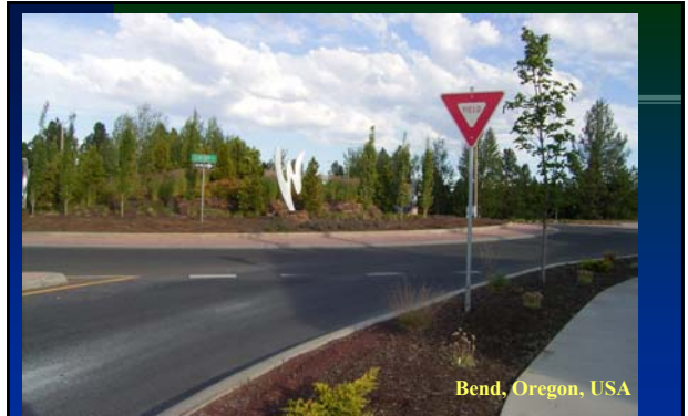
Bend, Oregon, USA