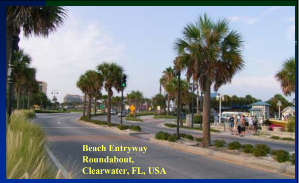
Beach Entryway Roundabout, Clearwater, FL, USA