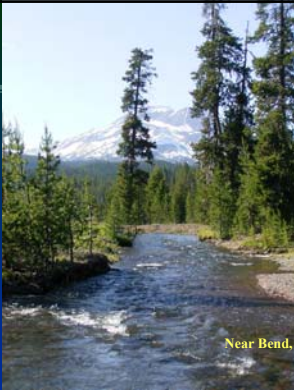
Near Bend, Oregon, USA