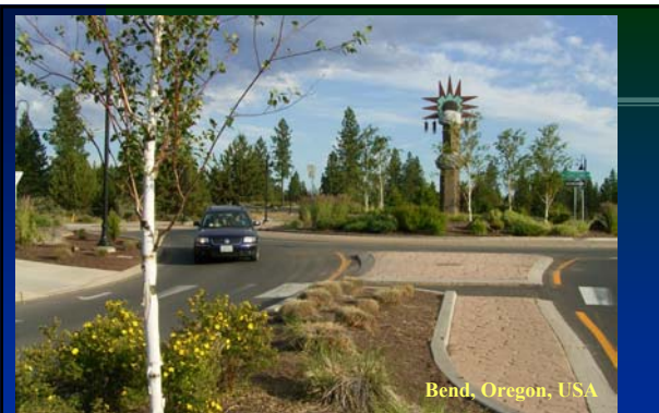
Bend, Oregon, USA