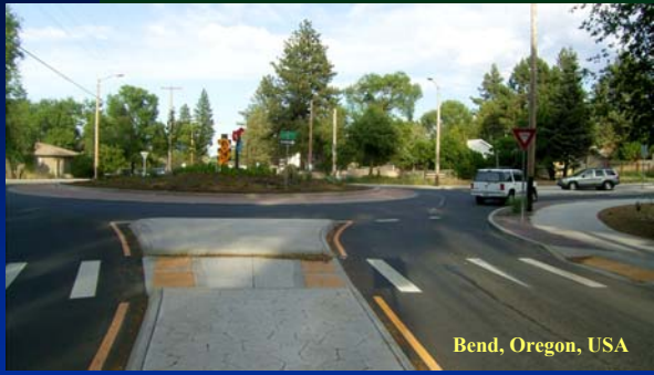
Bend, Oregon, USA