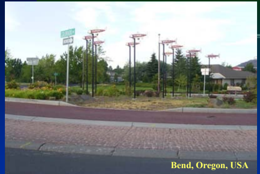
Bend, Oregon, USA