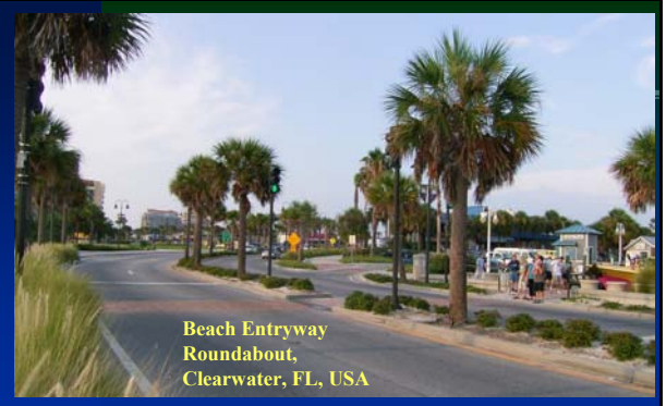
Beach Entryway Roundabout, Clearwater, FL, USA