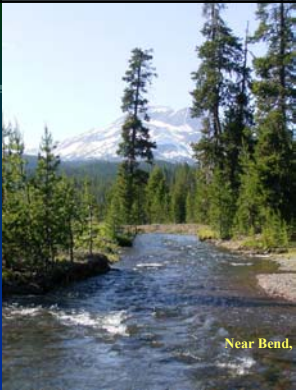
Near Bend, Oregon, USA