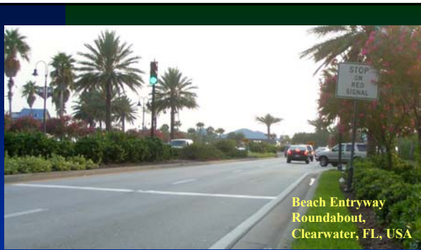
Beach Entryway Roundabout, Clearwater, FL, USA