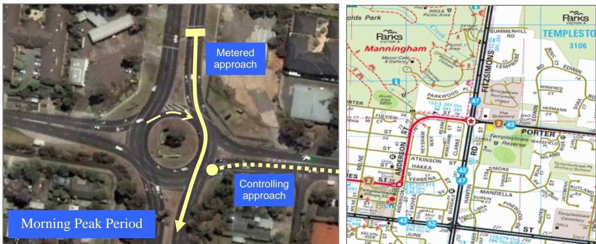
Figure 2 - Intersection of Fitzsimons Lane and Porter Street, Templestowe (Site No. 725)