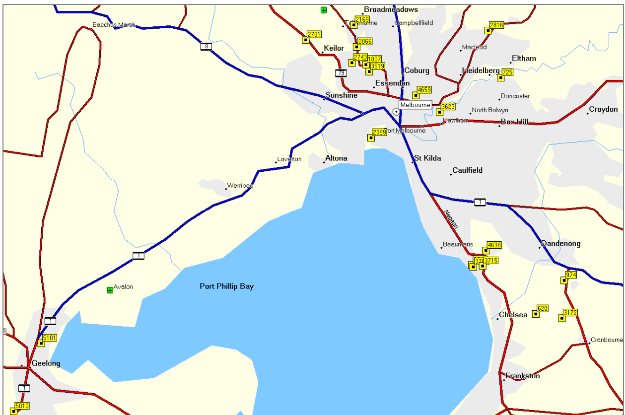
Figure 1 - Location of roundabouts with metering signals in Victoria (see Table 1)